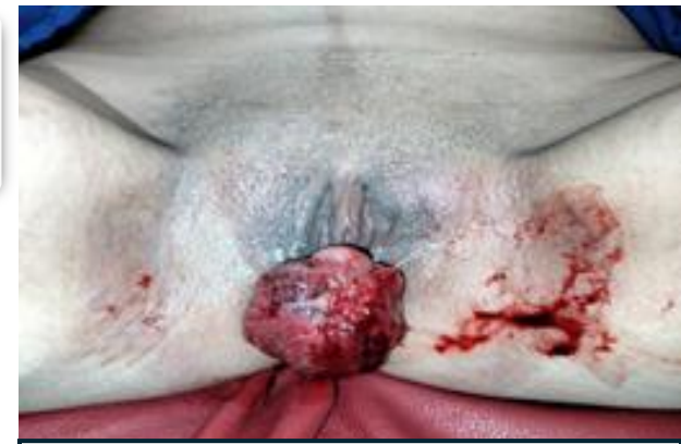
Figure 1: tumor cervical